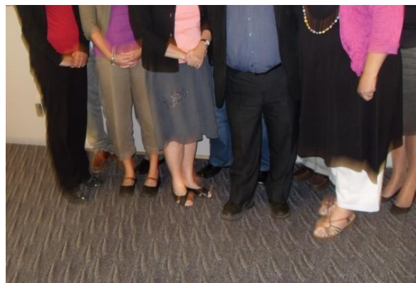
Richard Coll's last contribution, photo of the NZACE Council....