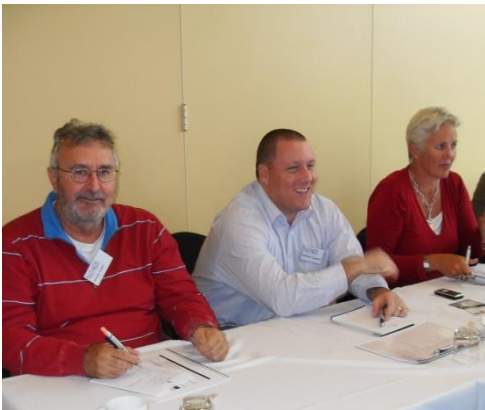
The Ozi's learning our rugby secrets