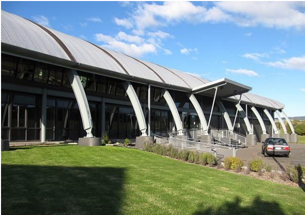
Conference venue: Sport & Rugby Institute, Massey University