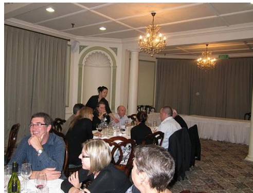
Wharerata Building, Conference Dinner